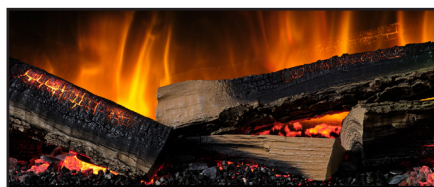
LOGS with ANIMATED EFFECTS