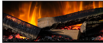
LOGS with ANIMATED EFFECTS